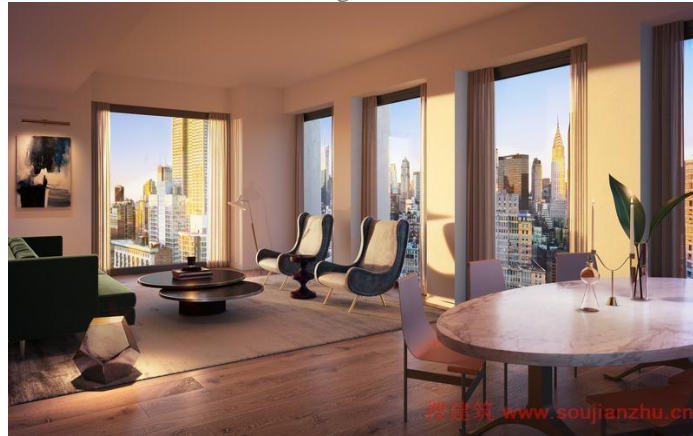
Top floor living room