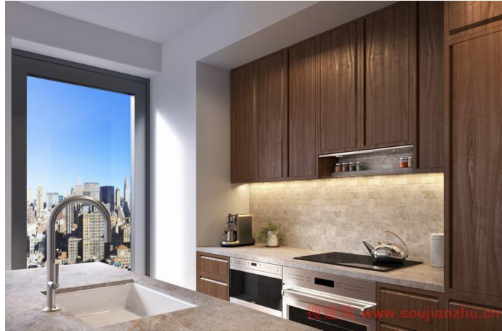
Top floor kitchen