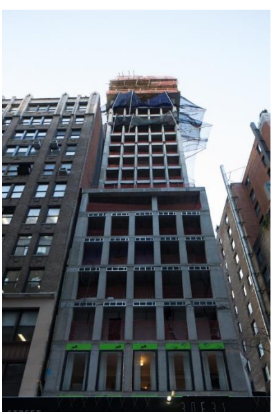
30 East 31st Street

Throwing back to YIMBY's first coverage of the site in 2014, we reported that the lot would likely produce a <u>14-story condominium</u> building. Now, construction is six floors taller than that, with the project expected to rise to an eventual height of 479 feet, yielding over 88,000 square feet of space within. The 38 condominiums will average just over 1,700 square feet apiece.