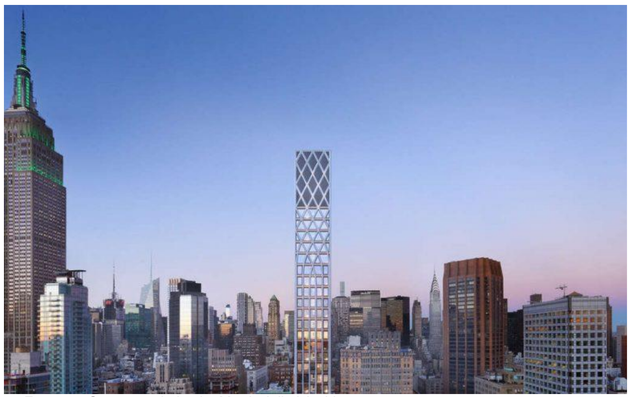
30 East 31st Street, rendering by Morris Adjmi Architects