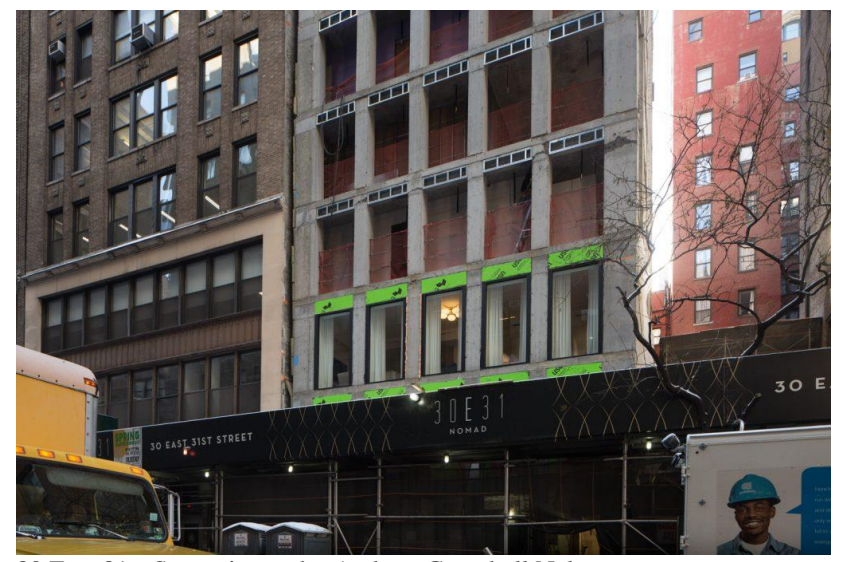
30 East 31st Street

Ekstein Development is responsible for the project. Completion is likely by the end of 2019.