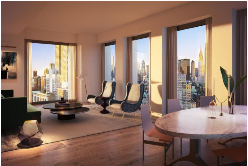
All renderings by The Neighborhood

Get a peek inside the high-end building on East 31st Street BY AMY PLITT@PLITTER OCT 24, 2017, 1:17PM EDT