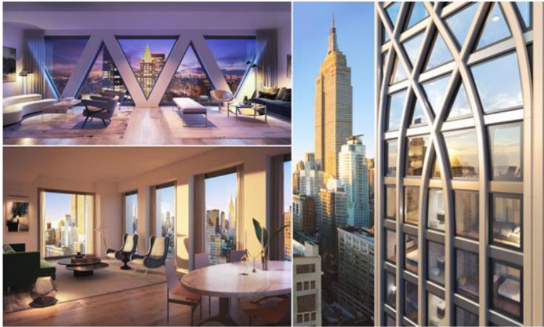
Renderings of 30 East 31st Street

This year, builders unveiled a medley of showstopping glassy high-rises, office towers built with new-age materials and lively reimaginings of existing stock. Here's a look at The Real Deal's collection of some of the hottest.